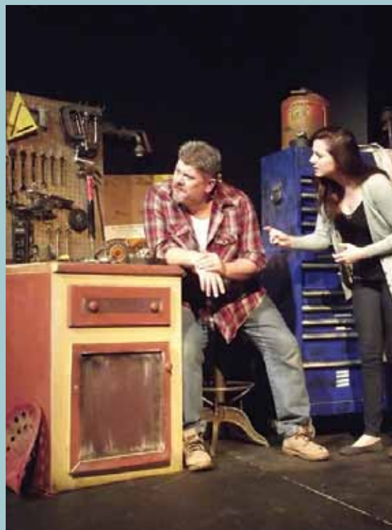
“Spiders in the Night”

DWU, belonging to Region 5 of the KCACTF, attends the regional festival each January along with North Dakota, Iowa, Missouri, Nebraska and Minnesota. The region showcases its best productions, as well as offers activities, workshops, symposiums and the regional-level award program. The program involves 20,000 students from 700 academic institutions throughout the country.