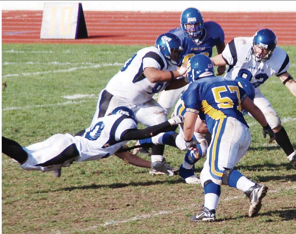
The men's football team currently sits in fourth place in the GPAC with a record of 5-3. The defense has played a large role in their success, recording 16 interceptions and 16 sacks.

The first home basketball game takes place Friday, November 7, when Black Hills State travels to the Corn Palace. The women play at 5:30 and the men follow at 7:30.