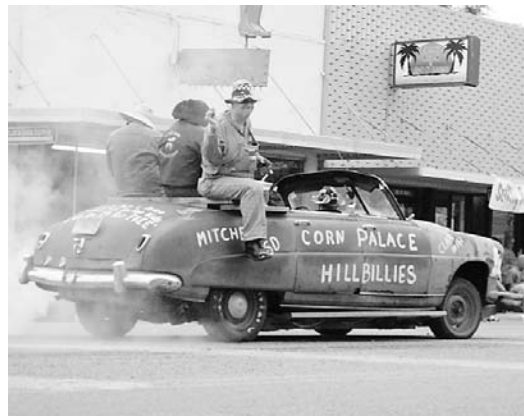
Hundreds lined Mitchell's Main Street on a brisk Saturday morning to celebrate DWU's annual homecoming parade. The October 11 parade saw the greater DWU family mix with local marching bands, politicians, activist groups, clowns, dogs, and more.