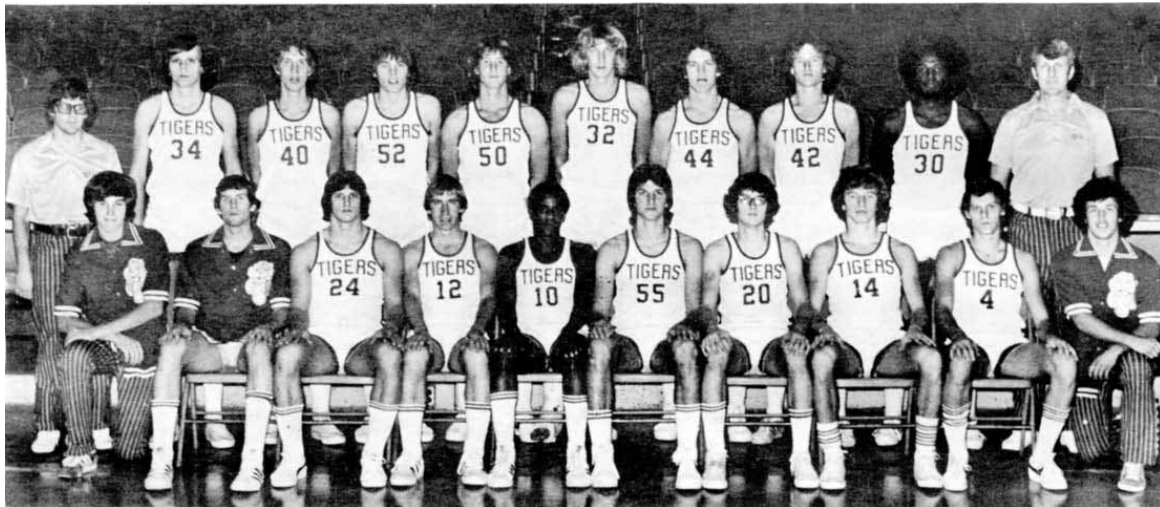
The team photo of the 1976-77 SDIC champions Tigers basketball team.

The fall pick-up date made it very difficult for graduates or seniors completing their student teaching to pick up their copies, said the recent