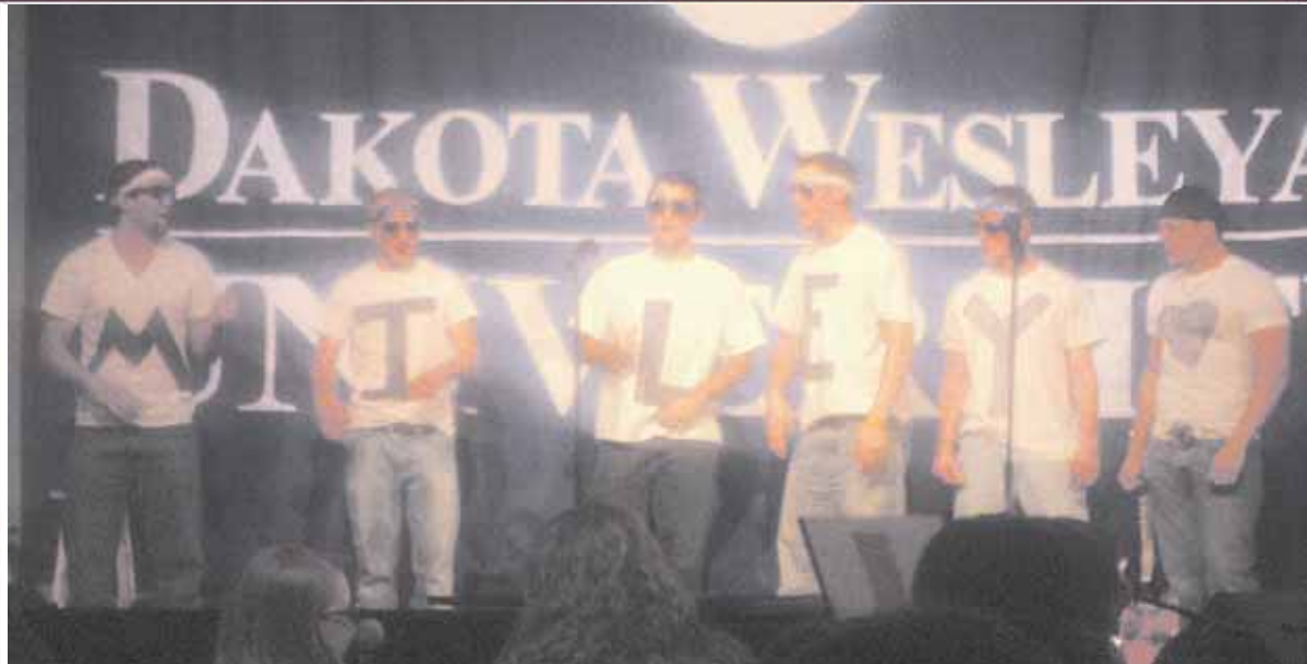
The Newman Crew showed some love for Miley Cyrus, performing "Party in the USA" during the second round of the Wesleyan Idol 2010 competition. The competition has drawn a large crowd each night.