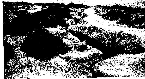
A CAPTURED TURKISH TRENCH, SUVLA BAY.

Nice to get away, after the disappointments of that worst of all months, August, when we had expected so much.