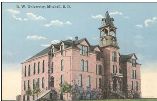
Postcard of Old College Hall, DWU

Check online at www.dwu.edu/library/archives.htm for more information.