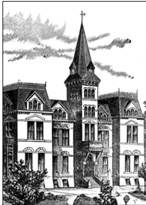
Merrill Memorial Hall, DWU

A small, private university located in Mitchell, S.D., DWU aspires to excellence in the liberal arts and professional programs. As the university for the Dakotas Conference of the United Methodist Church, Dakota Wesleyan encourages the dialogue between mind and soul, simultaneously building relationships, developing whole persons, and promoting service to God and humanity.