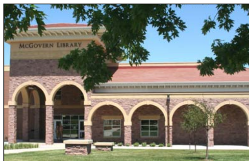
George and Eleanor McGovern Library and Center for Leadership and Public Service