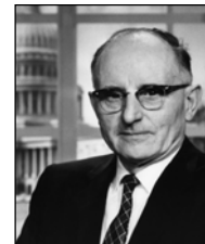
Sen. Francis H. Case

The Case Collection contains more than 300 linear feet of materials which represent the work of Sen. Case, a 1918 DWU graduate, during his 25-year membership in the U.S. Congress and Senate.