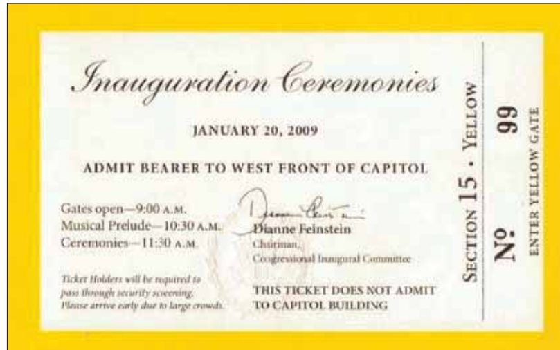
The "golden ticket" to the historic 2009 presidential inauguration

On January 20, President Obama offered his inauguration speech humbled by the task he is about to take on, he said. He comes to us aware of what he is about to take on as his job. As he said in his speech, "Today I say to you that