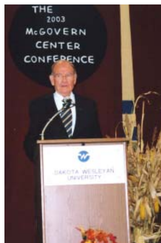
George McGovern takes to the stage during the 2003 McGovern Center Conference.