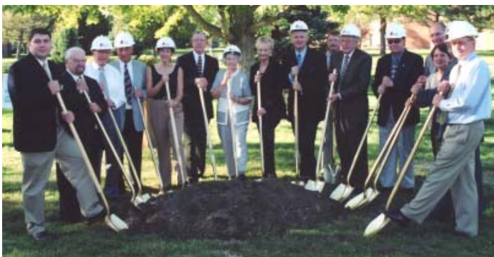
Faculty, staff, administrators, former university presidents and trustees attended the groundbreaking ceremony to mark the start of construction on the Sherman Center.