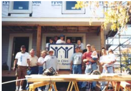
Habitat for Humanity Project: DWU alumni volunteered their time at a Habitat for Humanity house in the Twin Cities on Oct. 18, 2003. (submitted photo)