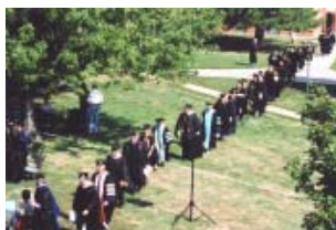
Fall convocation was held outside on the spot where the Sherman Center has since been built. Faculty marched from Smith Hall to the site.