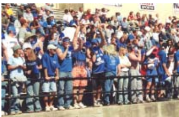
The homecoming game drew a large crowd.