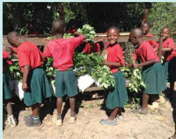
An “innovative garden” in Uganda