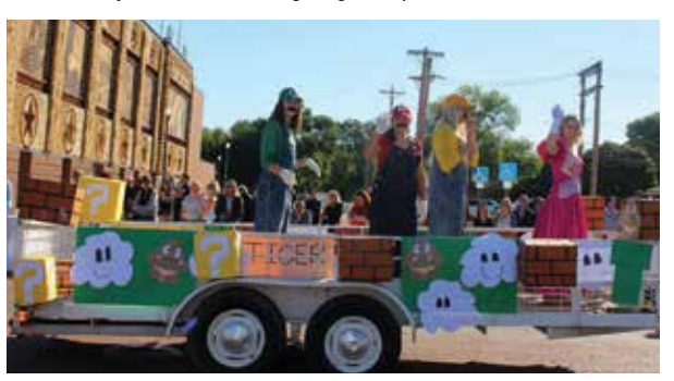
The Future Teachers Organization had a Mario Brothers-themed float in this year's parade, theme being "Video Games."