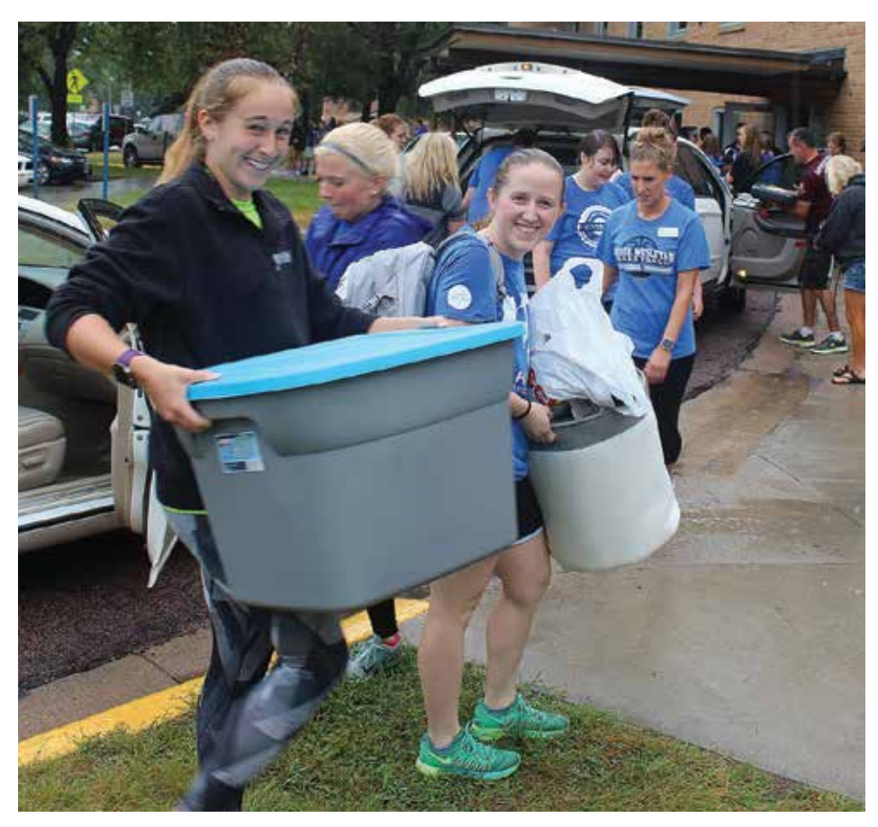
Like clockwork, at the beginning of each fall semester, DWU students, staff and faculty (and some of their families) all pitch in to help move the freshmen into Dayton Hall.