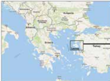
Map graphic made with help of Google Maps

"When they get down to the shore ... it's just an inflatable raft with a little engine on it that is made for eight, sometimes 10 people, and the smugglers pull out their guns and force 40 to 50 people on these things," Helmuth said. "So much danger, sometimes the waves are