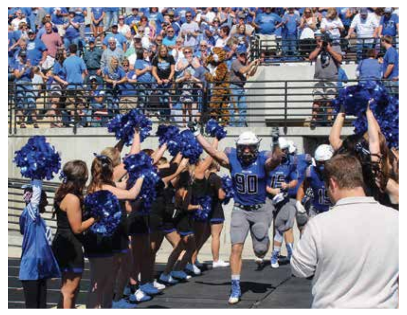
The Tigers take the field for Blue & White Days in a game against Doane.