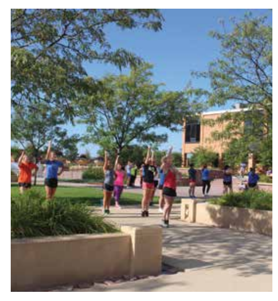
The DWU Cheer Team is the largest it has been in a long time – 24 students – and they are seen practicing in Jackson Plaza in August.