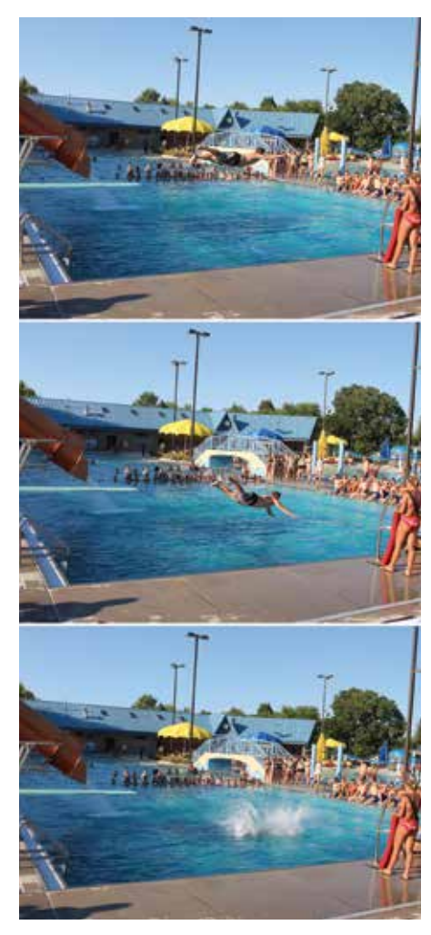
Some time ago the student life and athletics departments joined forces to bring a pool and picnic evening to DWU students on campus early for fall sports, cheerleading and athletic training. As part of the fun/chaos, the DWU football freshmen often engage in the "belly flop contest."