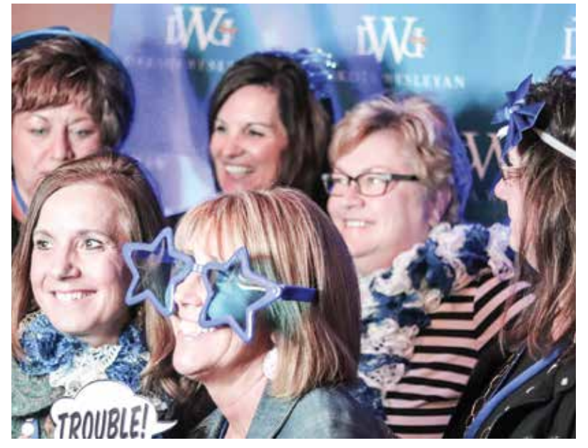
The annual all-alumni reunion, Blue & White Unite, brought in the crowds this year over homecoming weekend.