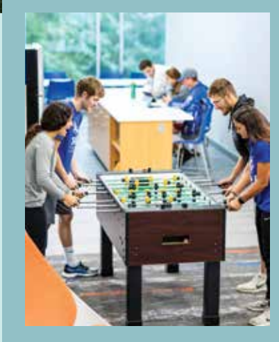
TOP: Students enjoy the community space inside Dakota Hall. RIGHT: Students are greeted by the floor-to-ceiling mural of the first building on campus – Merrill Memorial Hall.

Inside, a massive floor-to-ceiling mural commemorates the founding of DWU with an image of the university's first building, Merrill Memorial Hall. The original name of Dakota Wesleyan University was "Dakota University," which was the inspiration for the residence hall's name, Dakota Hall.