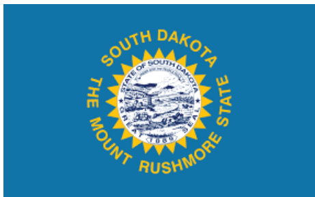
The official state flag of South Dakota is the only one of the 50 states to use the name of the state twice in the flag design.

DWU's McGovern Engagement Group has a new name and a renewed mission. The club is now called A Better South Dakota and is dedicated to working together for the common good. And what's its first project? Proposing a redesign of the South Dakota state flag, which currently says "South Dakota" twice and features a mysterious central image. But before the group gets there, it plans to request that the city of Mitchell consider the possibility of adopting a new city flag.