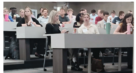
USD law students participate in a Courageous Conversation in August.

This year's topic, "The Age of Marriageability in South Dakota" (technically 18, but is actually 16), sparked deep, thoughtful engagement. The USD dean remains a strong advocate for the Braver Angels debate-style dialogue and plans to continue these civic conversations in the future.