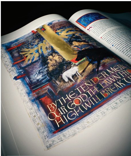
Birth of Christ , Donald Jackson, © 2002 The Saint John's Bible, Saint John's University, Collegeville, Minnesota USA. Used with permission. All rights reserved.

To view the 160 stunning illuminations in The Saint John's Bible , go to saintjohnsbible.org/turning-the-pages .