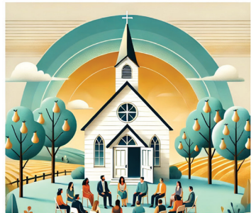
Published by the McGovern Center